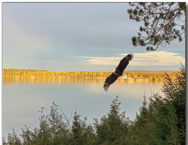
Eagle At Sunset