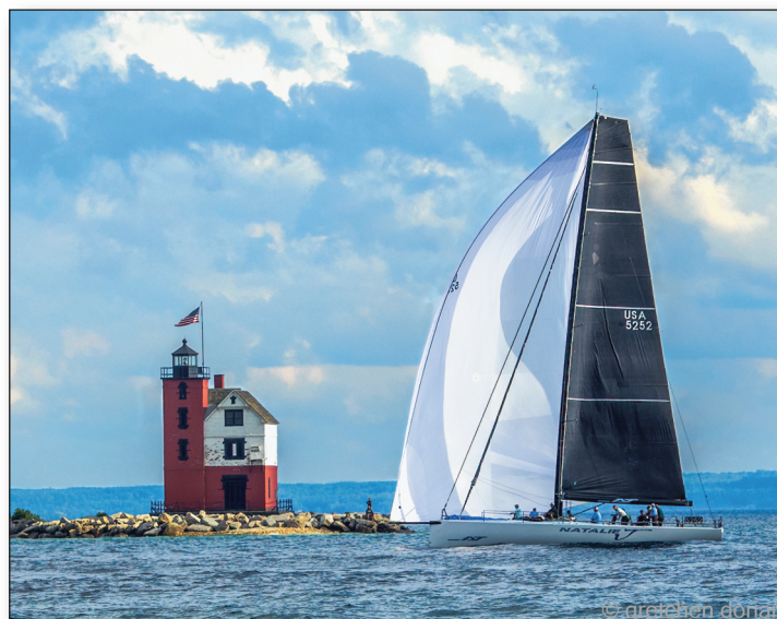
62312 - McGulpin Lighthouse Mackinaw City, Michigan