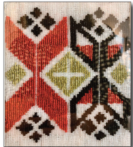
Potawatami style design