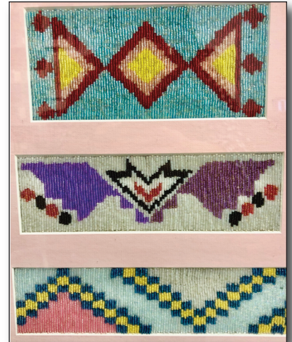
Osage and Blackfoot style designs

For more information about Sandy, contact Seven Elements Art Gallery.