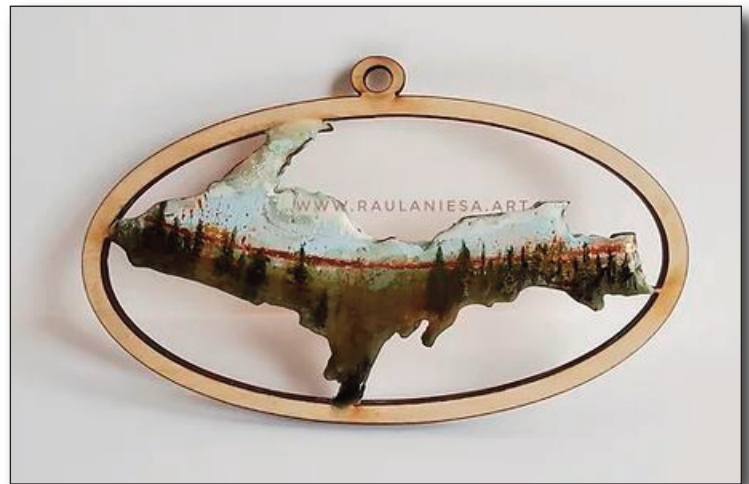
Almost Hunting Season