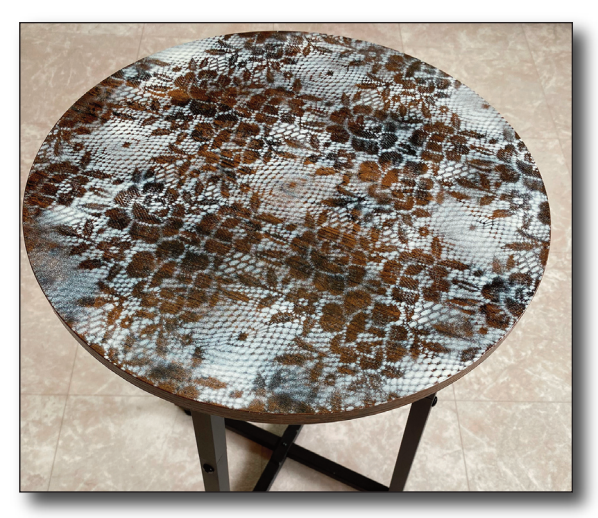
Renewed Lacy Table Top